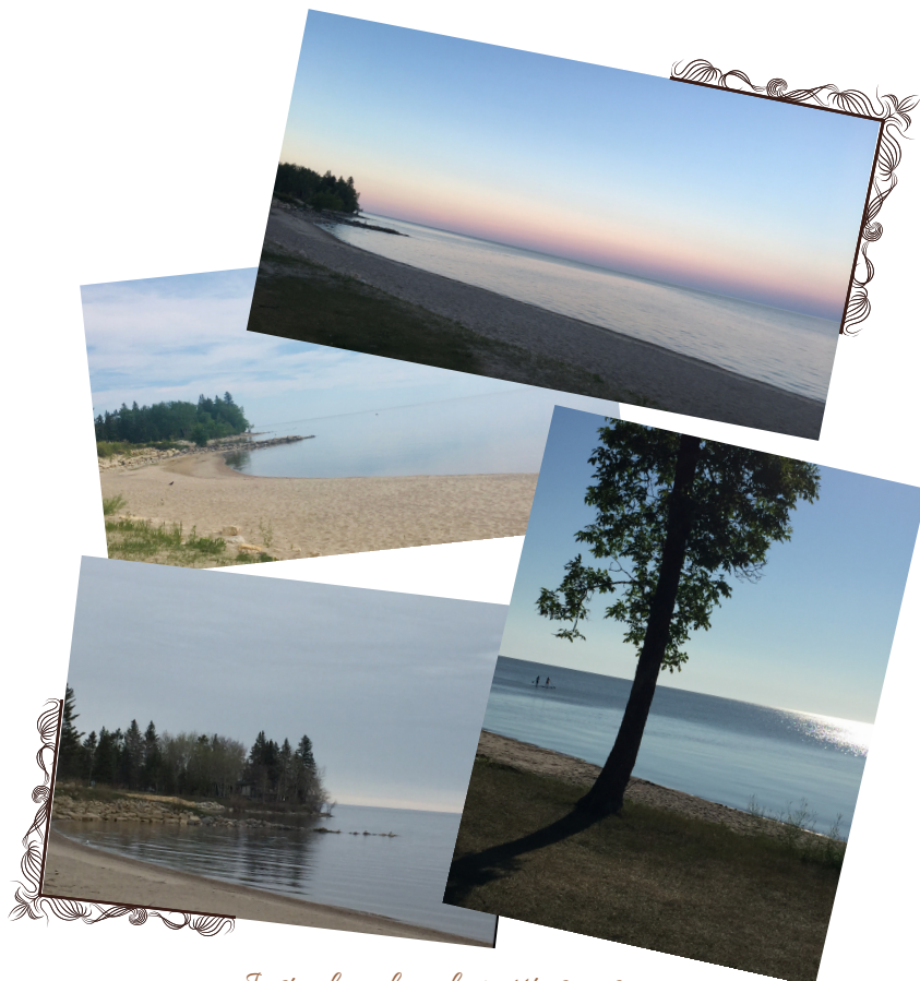
Just a few of my favourite snaps